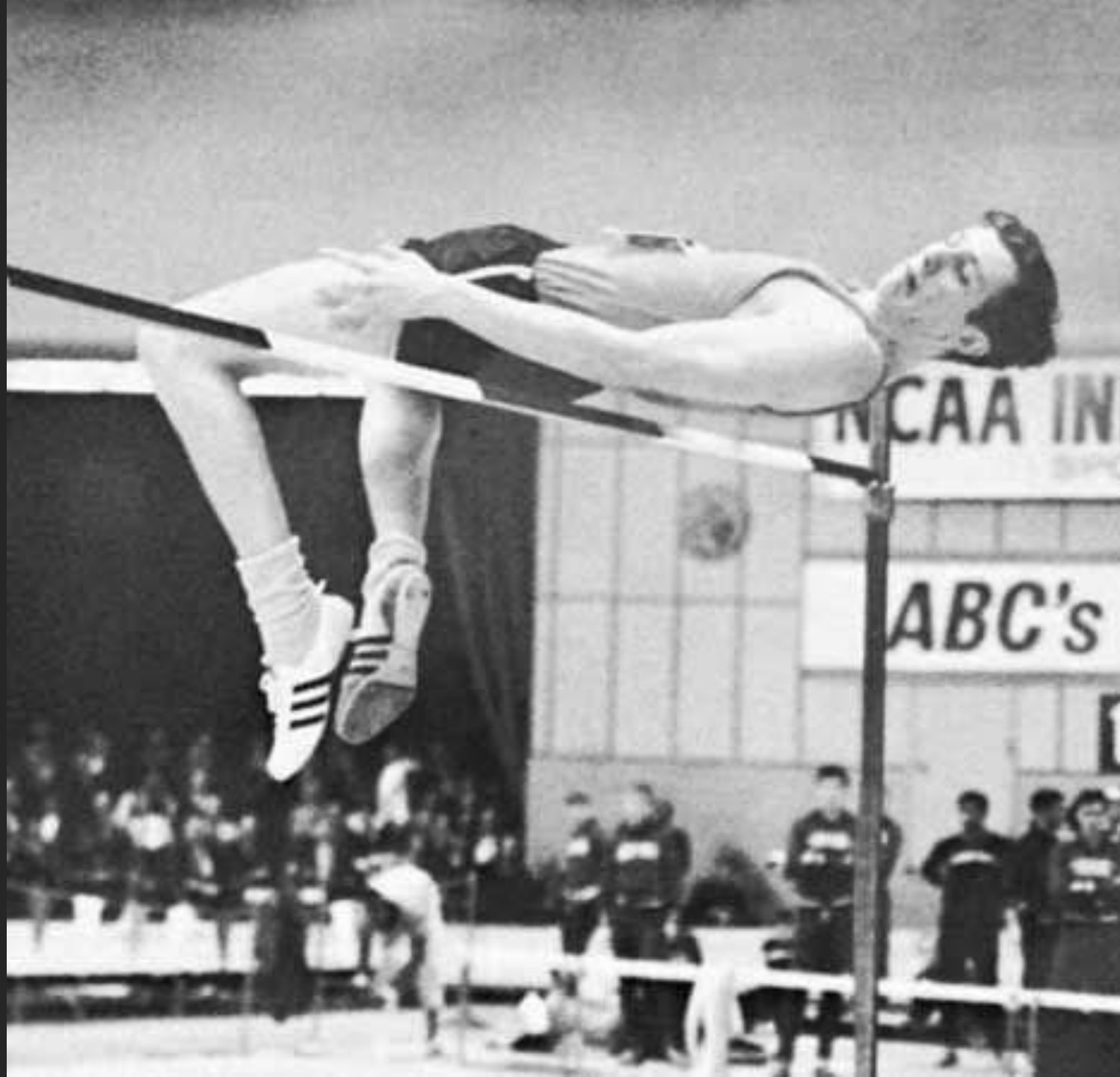
Dick Fosbury 1968 Gold