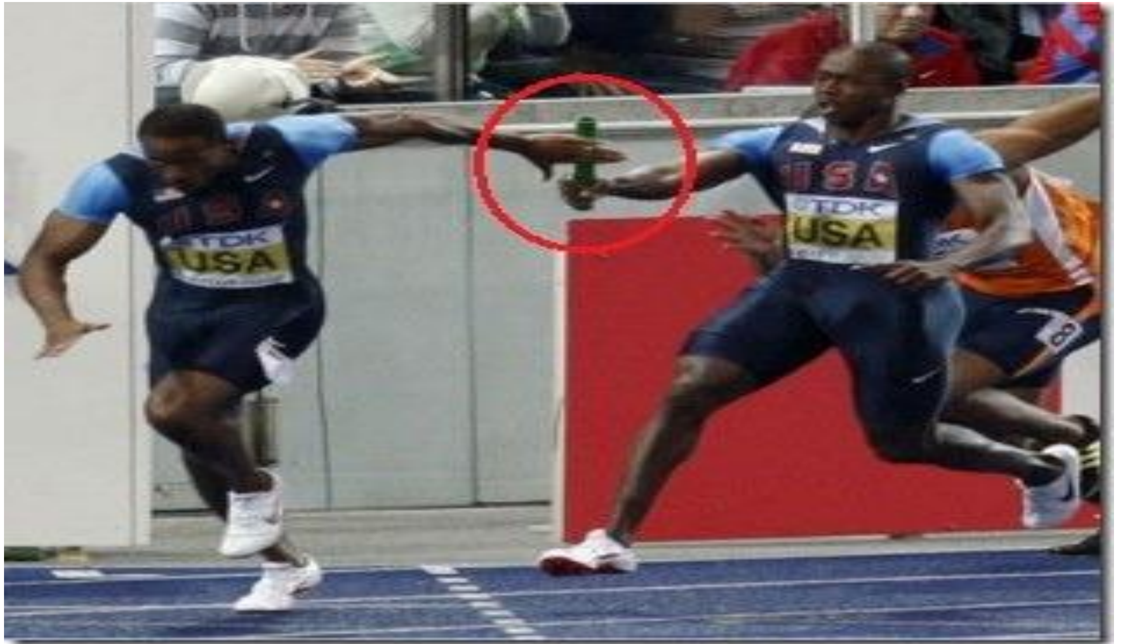
Personal Accountability Is about passing the baton correctly