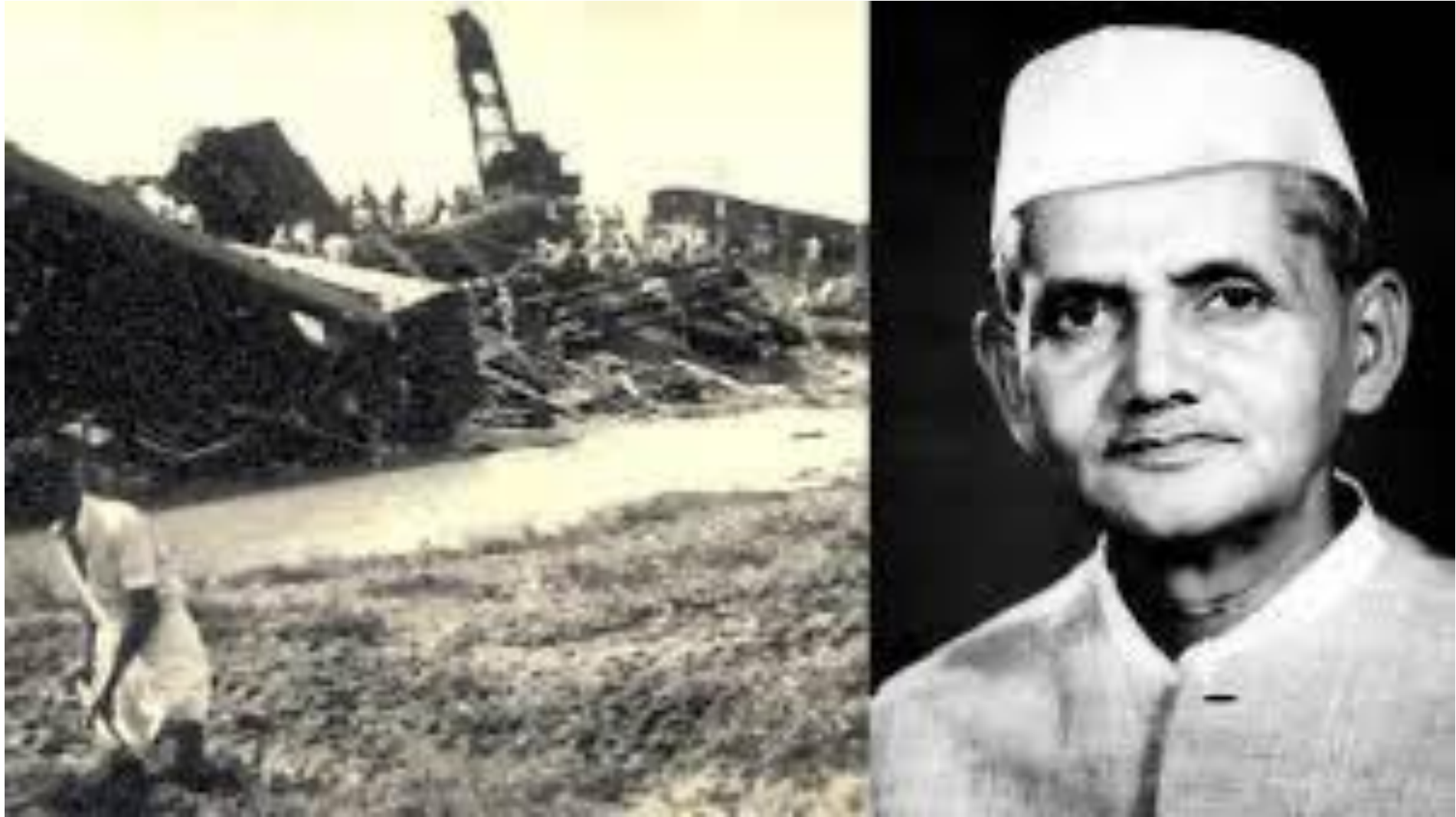
Shri Lal bahadur Shastri and the train accident